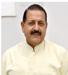
Shri Jitendra Singh Minister of state for Science and Technology, India