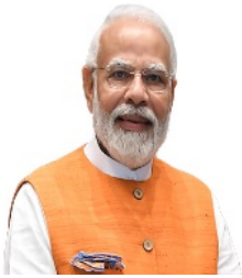
Shri Narendra Modi Hon'ble Prime Minister India