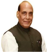
Shri Rajnath Singh Minister of Defence India